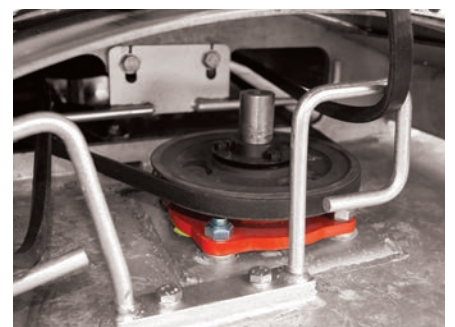
Improved belt engagement on larger drive pulleys to reduce slipping in heavier grass conditions.