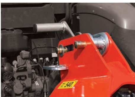
RLM unique and convenient transport lock.