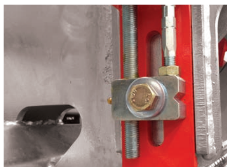
Adjustable rollers provides precision height control. Cutting height indicators for even height settings.