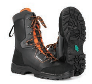
PROTECTIVE BOOTS - (LEATHER) WITH SAW PROTECTION C20 SIZE - EU 43, AU/NZ 9 597\ 65\ 94\text{-}43