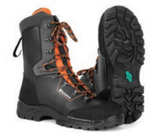
PROTECTIVE BOOTS - (LEATHER) WITH SAW PROTECTION C20 SIZE - EU 45, AU/NZ 10.5 597\ 65\ 94-45