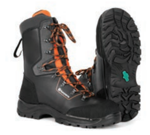
PROTECTIVE BOOTS - (LEATHER) WITH SAW PROTECTION C20 SIZE - EU 47, AU/NZ 12 597\ 65\ 94-47