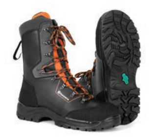
PROTECTIVE BOOTS - (LEATHER) WITH SAW PROTECTION C20 SIZE - EU 44, AU/NZ 9.5 597\ 65\ 94-44