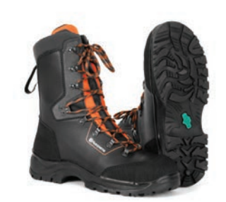
PROTECTIVE BOOTS - (LEATHER) WITH SAW PROTECTION C20 SIZE - EU 42, AU/NZ 8 597\,65\,94\text{-}42