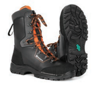
PROTECTIVE BOOTS - (LEATHER) WITH SAW PROTECTION C20 SIZE - EU 46, AU/NZ 11 597\,65\,94-46