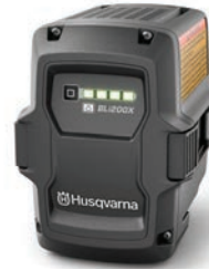
BLI200X BATTERY 970 44 89-01