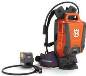
BLI950X BACKPACK BATTERY 967 09 32-01