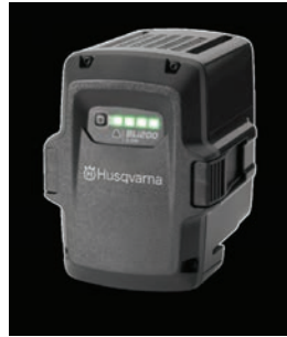
BLI200 BATTERY 967 09 19-01