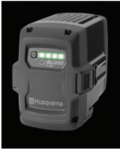
BATTERY BLI300 967 07 19-01