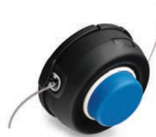
T35X TAP-N-GO™ TRIMMER HEAD (BALL BEARING) 578 44 65-01