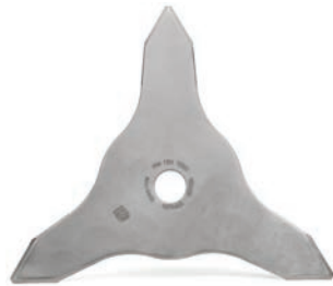
GRASS BLADE - 3 TOOTH, Ø 255MM, 1" ARBOR 578 44 49-01