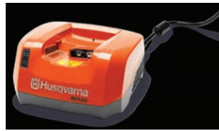
CHARGER QC500 970 44 95-05