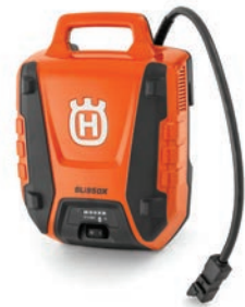
BLI950X BACKPACK BATTERY MODULE 579 82 22-01