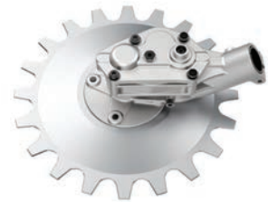
HUSQVARNA RA-V RECIPROCATOR GEAR HEAD ASSEMBLY 967 90 86-01