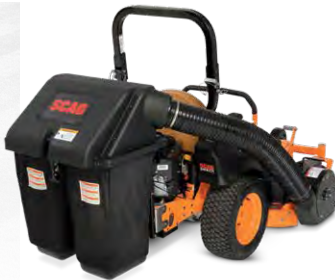
2-Bag Grass Catcher with Spindle-Driven Blower

"The quality-of-cut, drive-motor power and comfort."