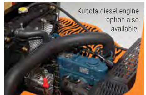
Kubota diesel engine option also available.

Turf Tiger II™ propane-powered model features a Kohler® Command PRO® EFI engine, along with a standard industrial, 33.5 lb/7.9-gallon, aluminum LP tank. Vapor withdrawal for maximum reliability.